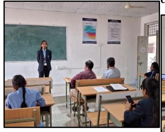
Elocution & Essay writing competition: